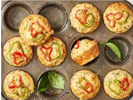
These freezer-friendly muffin-pan pizzas are perfect for the school lunch box

Half x red capsicum, half x green capsicum, 3/4 cup SR flour, 1/4 cup plain flour, 2 teaspoons mixed herbs, 1/3 cup finely chopped basil leaves, 1/2 cup grated cheese, 100g sliced ham, (chopped), 2 tablespoons chopped sun dried tomato, 1 x clove garlic, 5 lightly beaten eggs, 1/3 cup milk.