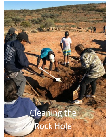
Cleaning the Rock Hole