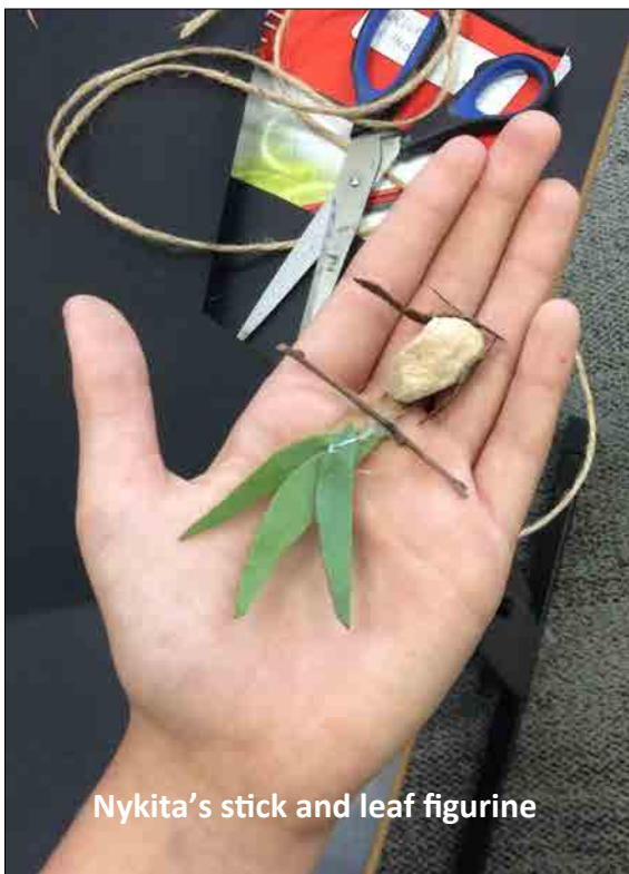
Nykita's stick and leaf figurine

Year 5/6 students have been learning about traditional life for Indigenous Australians. They then had an opportunity to make some artefacts from the natural resources around them, just as traditional Indigenous people would have!