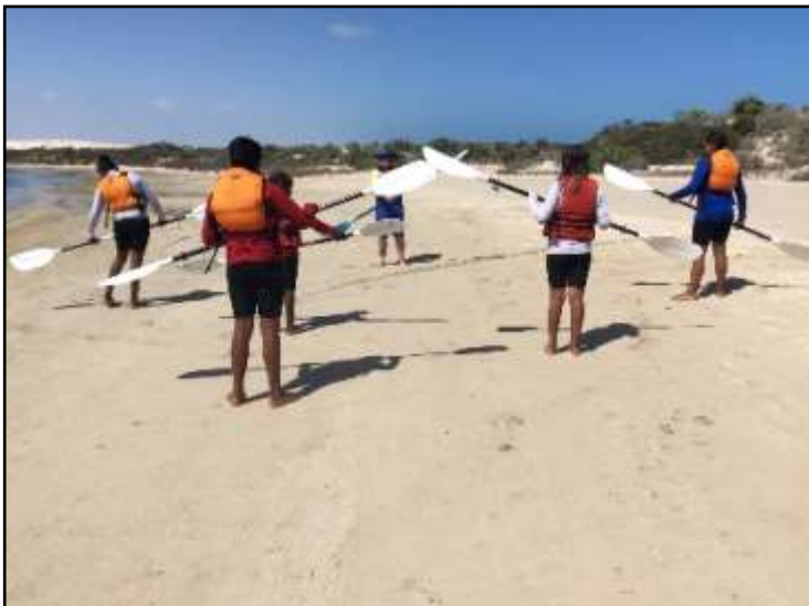
Year 6 Students being instructed at Blue Lake