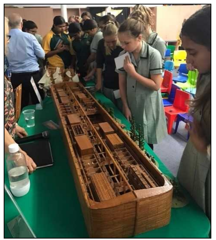
Crossways students viewing the Ark replica