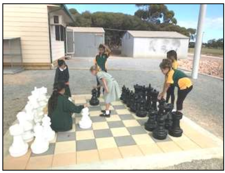
Above: It is great to see the students using the outdoor chessboard at Recess and Lunch at School.