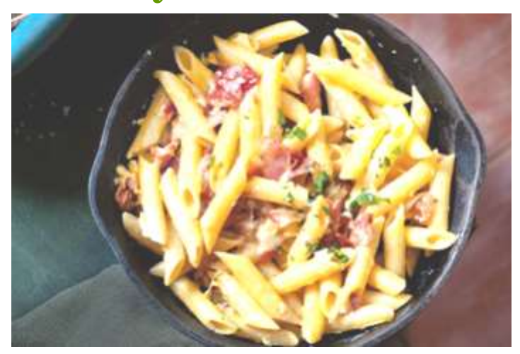
400g Penne Pasta, 200g Bacon Rashers diced, 150g Parmesan Cheese (grated), 1/2 cup chopped Parsley, 1 tablespoon Olive Oil, 4 eggs lightly whisked.

Cook the pasta in boiling water then place drained pasta in saucepan.