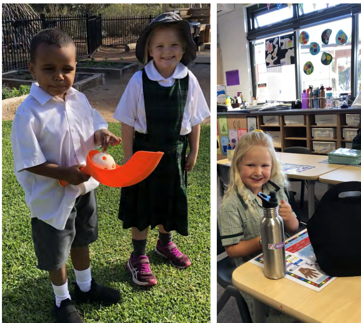
It was the first day of school for the above students on Monday.