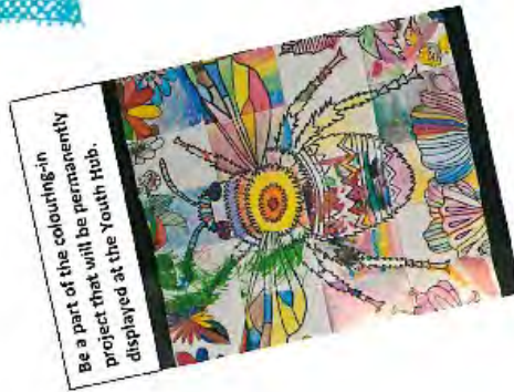
Be a part of the colouring-in project that will be permanently displayed at the Youth Hub.

For more information or to organise a lift call: Save the Children on 0429 041 823