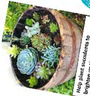
Help plant succulents to brighten up the Youth Hub