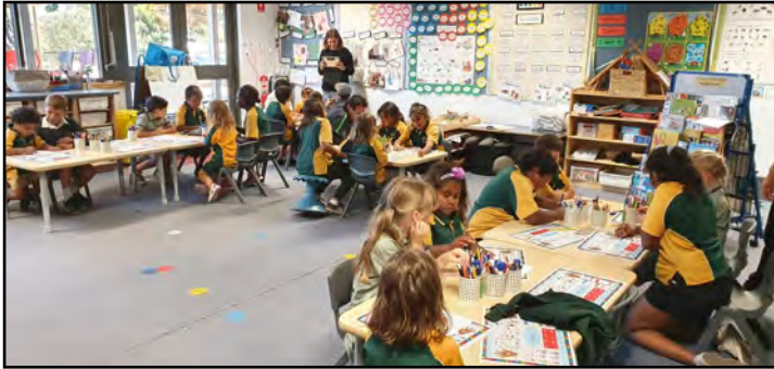
Students bonding in Buddy Class

This week the Foundation class got to meet their Buddy Class.