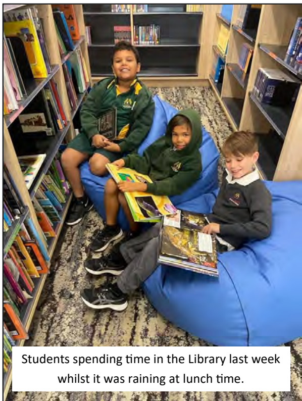
Students spending time in the Library last week whilst it was raining at lunch time.

I look forward to seeing you around our school community.