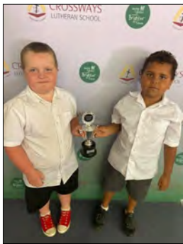
LEFT: Week 6 Class Attendance Cup winners, Year 2's