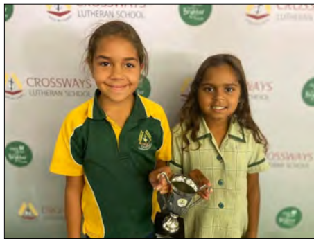
RIGHT: Week 6 Class Recycling award winners, Year 3 class