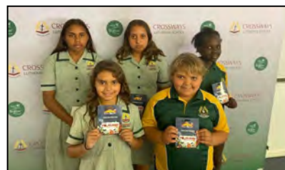
Above : 100% award winners