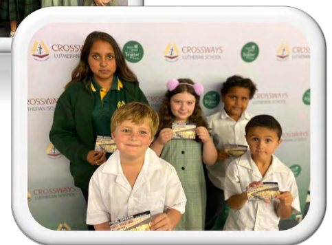
Right : 100% Attendance Winners (Week 2)