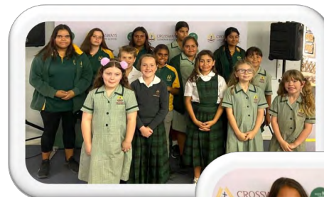
Left : Students who excelled in behaviour and work ethic during Week 2