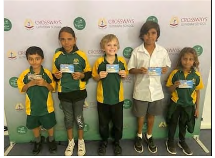
100% attendance winners Week 5