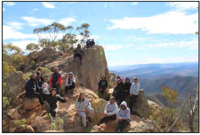
The Year 8/9/10 Camp at the Flinders Ranges this week Top: Students in front of Arkaroo Rock Bottom: Saint Mary's Peak