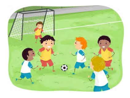
POINTS UP FOR GRABS FOR EVERY WIN AND EXTRA FOR THE GRANDFINAL