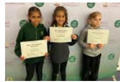
Junior School German