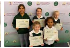
Junior School Art