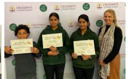
Middle School Art