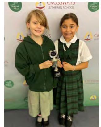
Class Attendance Wk 8 Year 5 Class