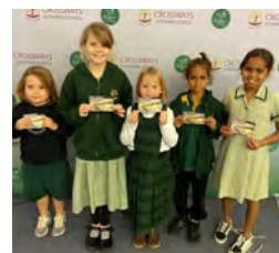
100% Attendance Award Winners For Week 8