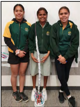
Year 6/7 students participating in STEM activities