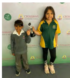
Above right : Attendance Cup winners (Year 1 Class)