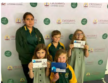
Above left : 100% Attendance winners