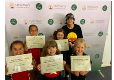
Junior School Art Awards