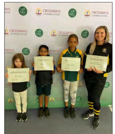
Junior School Choir Awards