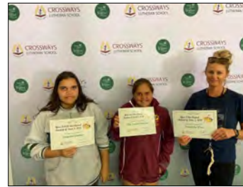
Middle School Art Awards