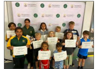
100% Attendance Awards