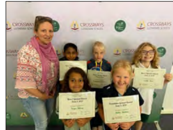
Junior School German Awards