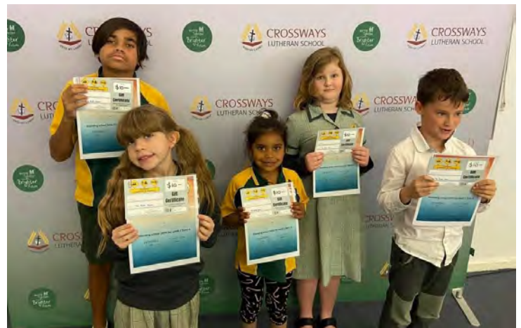
100% Attendance Award Winners for Week 1