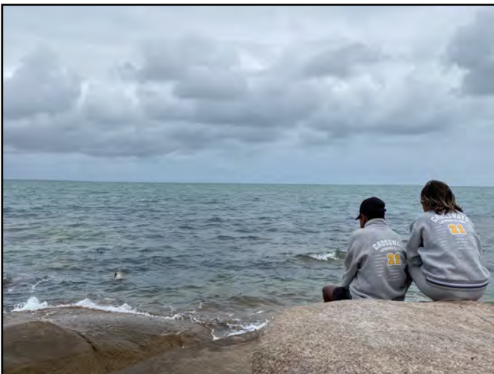
Students participating in Outdoor Education at Ceduna Waters where they did a coastal clean-up walk.

There is so much to look forward to this term as we lead into our summer holidays for 2021. I look forward to some exciting events coming up. Be sure to keep updated with our school Newsletter and Facebook page for information regarding events.