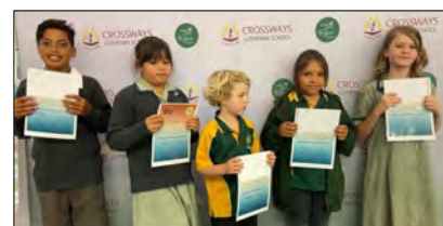
100% Attendance Winners