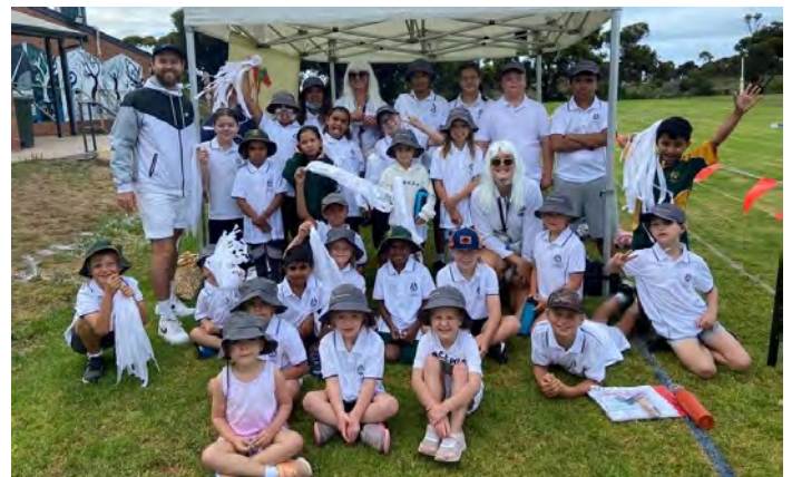
The Victorious 'Kingfisher' team !