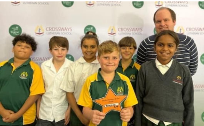
Above : GGSA Maths award winners