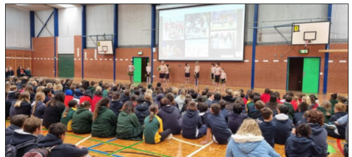
Crossways staff and students attended the 'Dusty Feet' performance at the Area School this week as part of NAIDOC week celebrations