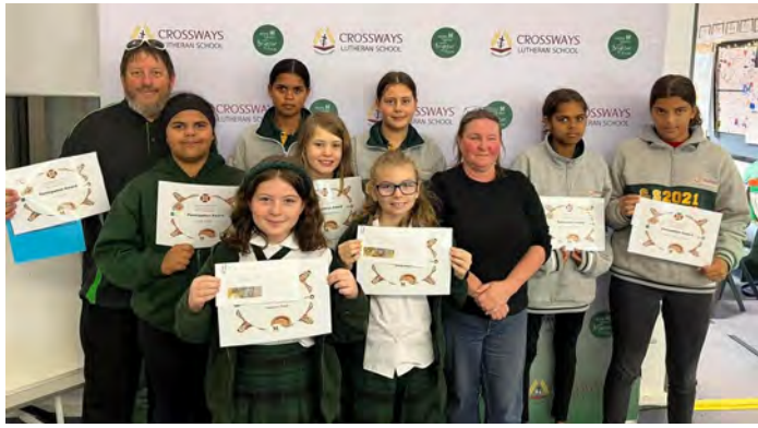
NAIDOC Art Exhibition award winners