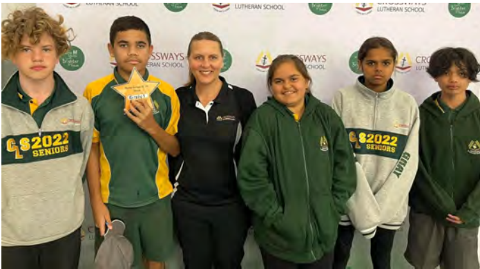
GGSA Maths award winners