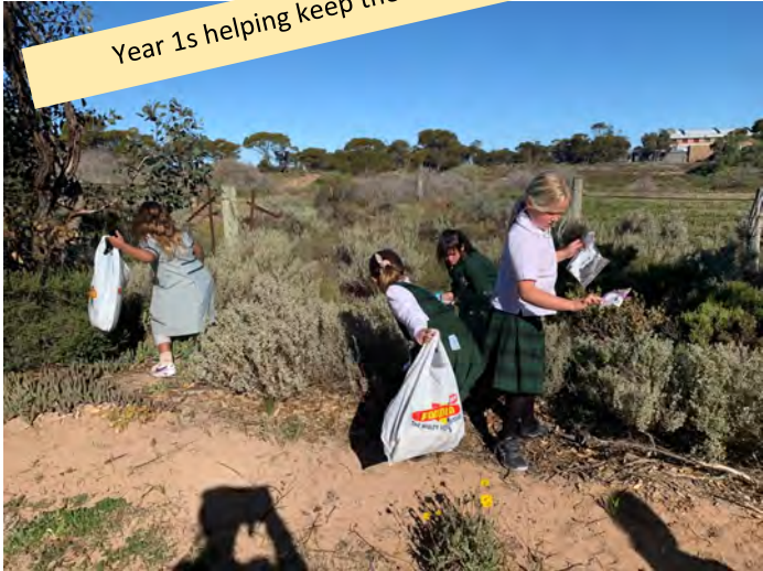
Year 1s helping keep the school grounds clean.