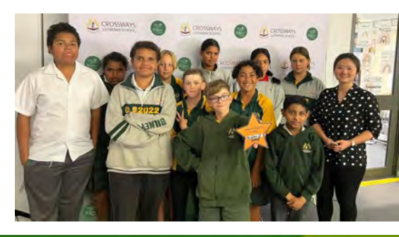
GGSA Maths Award Winners !