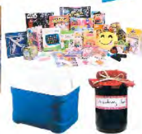
*Photo Examples only not actual hampers