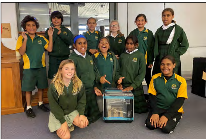
The excited Year 5 class with their brand new 3D printer.