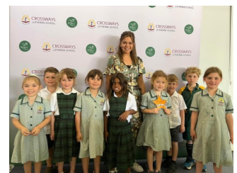
Above right : Foundation Class GGSA Maths award winners.