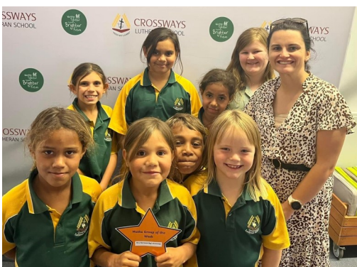
Year 2 GGSA Maths Award Winners