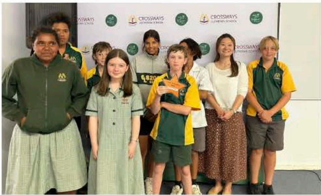
Above : Year 6/7 GGSA Maths award winners