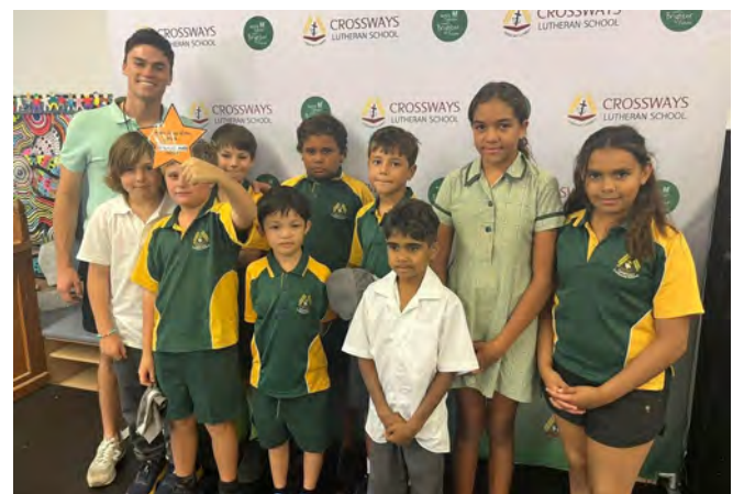
GGSA Maths award winners