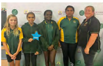
Left : GGSA Spelling Award winners