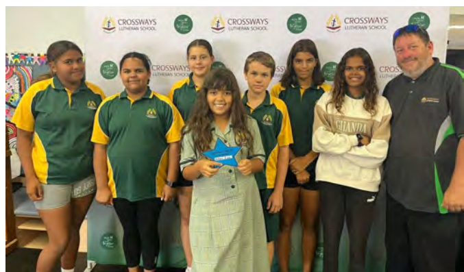
Above : GGSA Spelling award winners