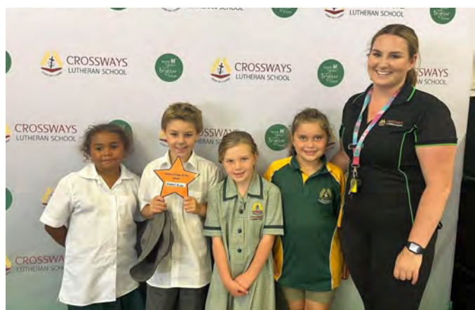
Above : GGSA Maths award winners