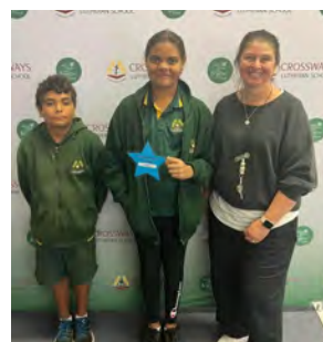
Above left : GGSA Maths award winners.