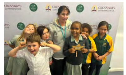
Above right : GGSA Spelling award winners.