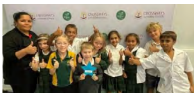
Left : GGSA Spelling Award Winners