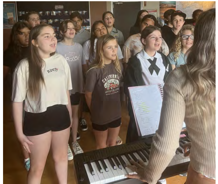
The Middle School Choir performed at various places in Port Lincoln last week!

Reminder : This Friday is a STUDENT FREE DAY