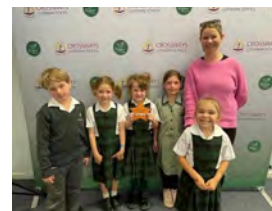
GGSA Spelling Award winners