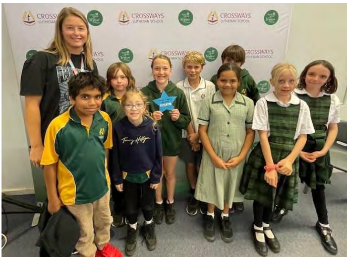
Above : GGSA Maths award winners