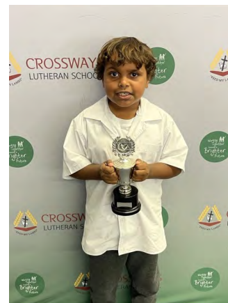
Left : The year 2 class received the Attendance Cup for Week 9.