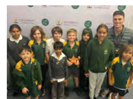
GGSA Maths & Spelling award winners