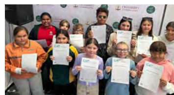
Left : Students with 'Participation' Certificates for the C.A.T. testing.