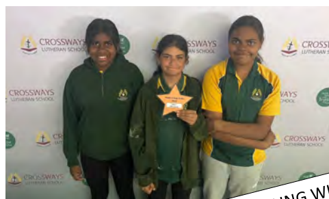
GGSA MATHS & SPELLING WINNERS