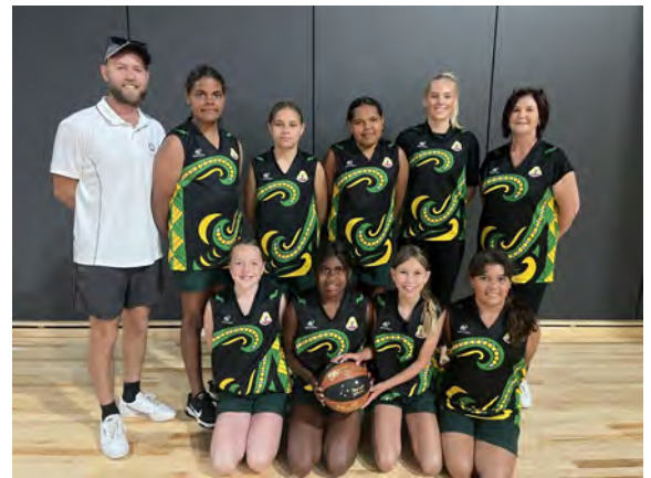
Above : The Crossways Basketball Team that competed in Adelaide last week.