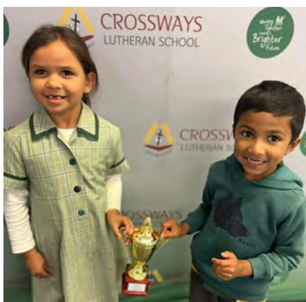
Week 1 Class Attendance Winners (Foundation Class)