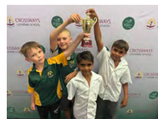
Above right : Attendance cup was awarded to the Year 5 class