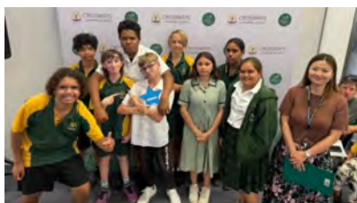
Left : GGSA Spelling Group winners