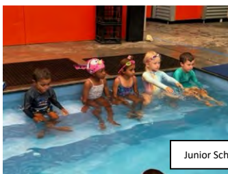
Junior School Swimming