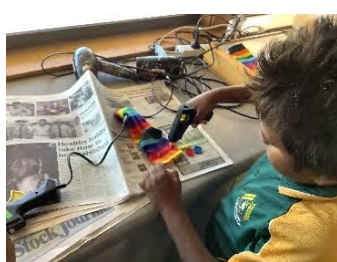
Puppet Making Elective