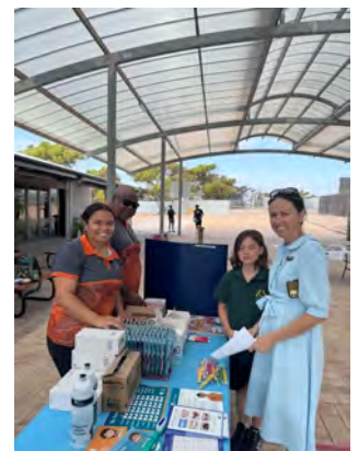
FAMILY INFORMATION NIGHT AT CROSSWAYS