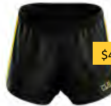
SPORT SHORTS (UNISEX)