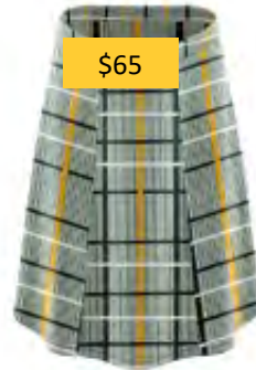
GIRLS SKIRT (SUMMER OR WINTER)