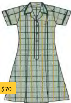
SUMMER DRESS (FRONT VIEW)