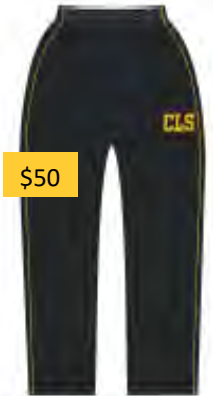
TRACK PANT (UNISEX)