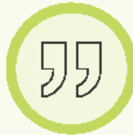
Conventions of language (spelling, grammar and punctuation)