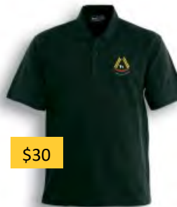
POLO TOP (UNISEX)