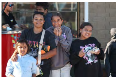
Working Together Towards a Brighter Future (M)